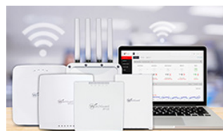
Secure Cloud Wi-Fi